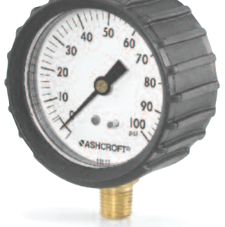
Shown with Optional Rubber Boot